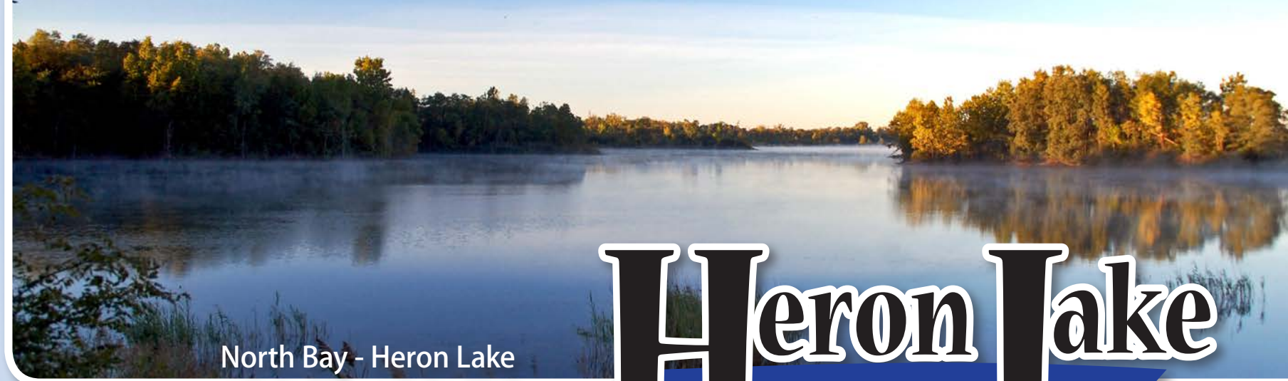
North Bay - Heron Lake