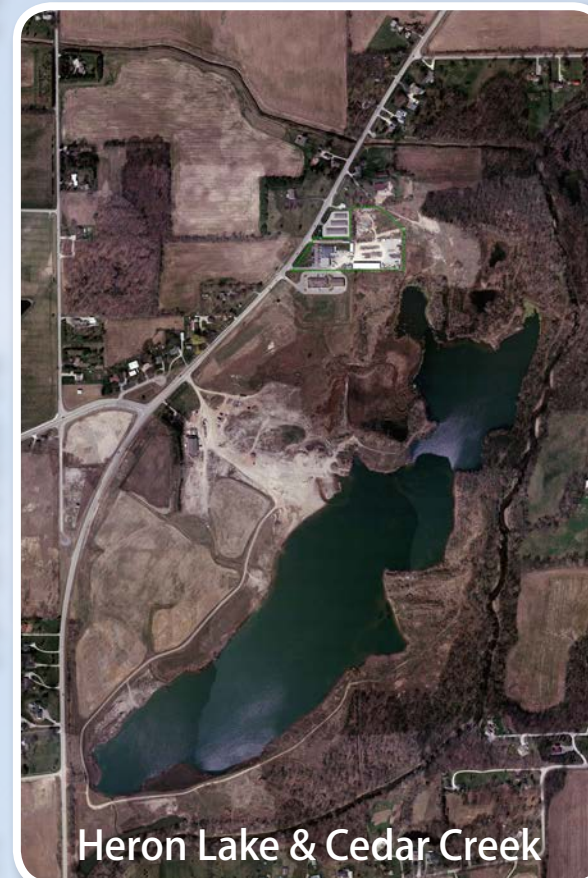
Heron Lake & Cedar Creek

Heron Lake is located in Northeast Indiana on the south side of Auburn, 10 minutes north from Dupont Road on I-69, Coldwater Road or CR427. With a total site size in excess of 300 acres and nestled along Cedar Creek, this is an ideal location for everything "Northside Fort Wayne."