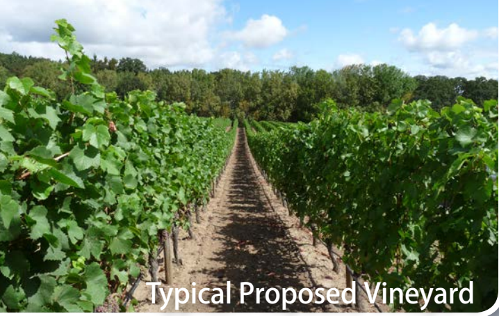
Typical Proposed Vineyard